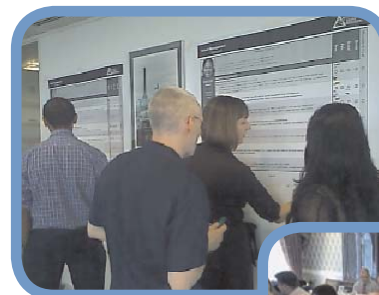
Workshops in progress

Pilat have developed 2 programmes approved by the CIPD for Continuous Professional Development (CPD) that are directly focused at building participants' ability to take action on-the-job to keep all employees fully engaged and contributing to the organization's success. Participants get hands-on experience with a number of proven talent solutions targeted at building a solid understanding of what it takes to engage and retain employee talent.